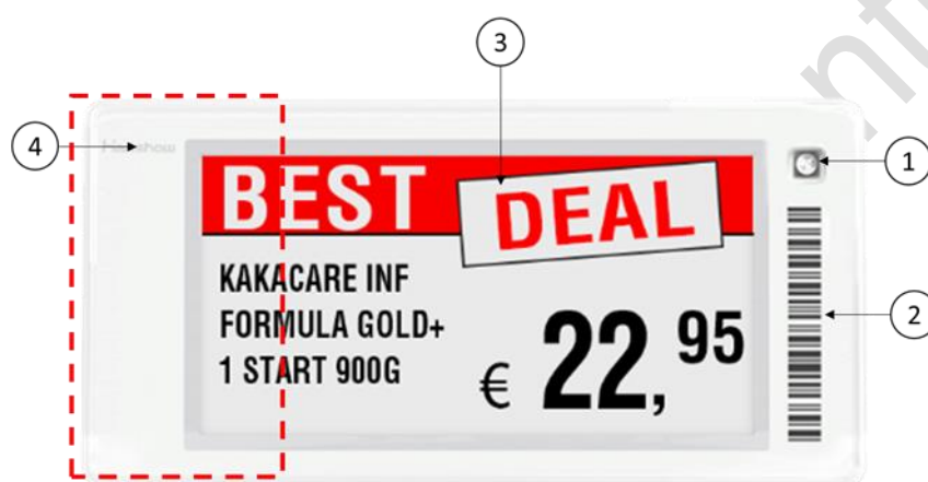
Figure 2-1 Front area of Stellar-XM E31

The front area of Stellar-XM is shown in Figure 2-1 , and the function of each area is shown in Table 2-2 .