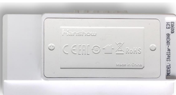
Figure 2-2 Rear panel of Stellar-XM E31

The rear area of Stellar-XM is shown in Figure 2-2 .